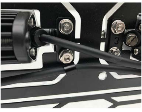
2. If your installation has ZROADZ LED lights use the supplied wire clip on (1) each of the lower side mounting screws as shown to retain the cable.

1. Install the supplied trim with hardware. If your installation has ZROADZ LED lights start on one side of each of the (4) openings. Install the trim on the front and the bracket on the back of the grille as shown.