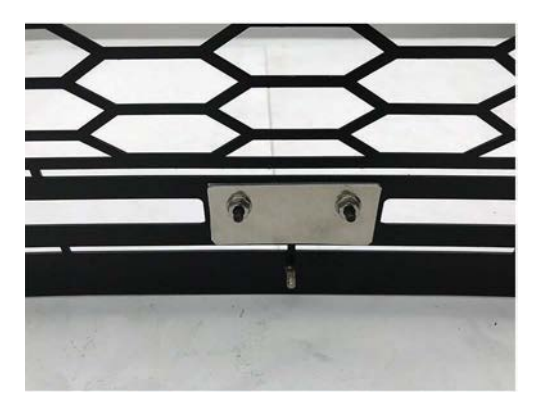
4. Use the supplied black hardware to install the logo back plate.